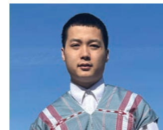
2019: Eh Customer Service Representative at Engage Workforce Solutions. He is going back to UWM for a Masters in Accounting.