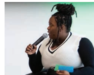
2018: Yona Entrepreneurship Apprentice Educator at Teens Grow Greens. She hopes to collaborate with other programs to increase the outcomes for teenagers from Milwaukee!